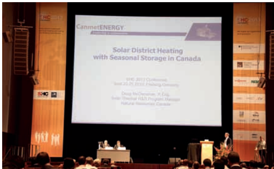
The SHC 2013 was attended by 400 participants, which is almost twice as many as last year.